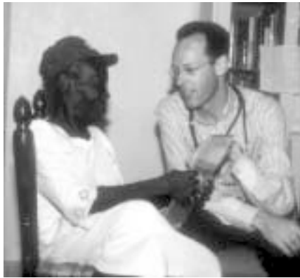
Paul Farmer talks with a patient in Haiti

The DRCLAS Haitian Initiative fosters collaboration between Harvard and institutions in Haiti and facilitates research opportunities for Harvard faculty and students. The program stresses interdisciplinary approaches to thinking about Haiti, a nation that profoundly reflects the historical, cultural, and even ecological dynamics established by the forced meeting of three worlds: Arawak, European, and African.