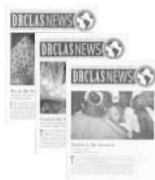
DRCLAS News, the Center's Newsletter, have a new look as of Fall 2001 and a new ReVista: Harvard Review of Latin America