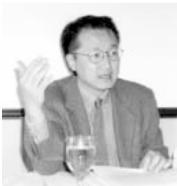
Jim Yong Kim