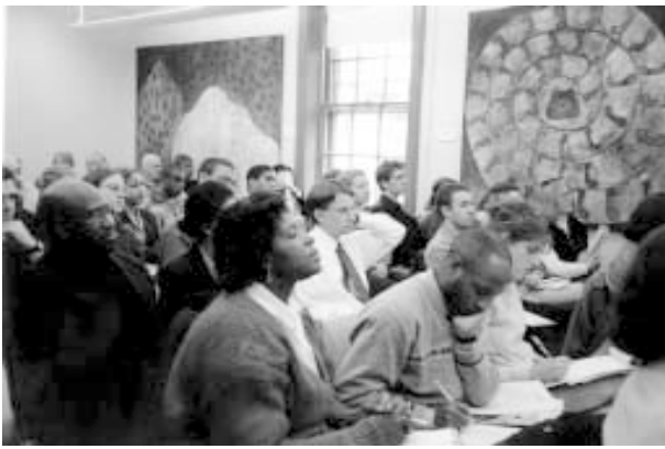
Audience members listen and take notes at a Haitian series lecture

18: Dominican Identity: A Glimpse of a Complex Mosaic, Professional Development Workshop for K-12 Teachers and Counselors , co-sponsored by the World Affairs Council and Bunker Hill Community College.