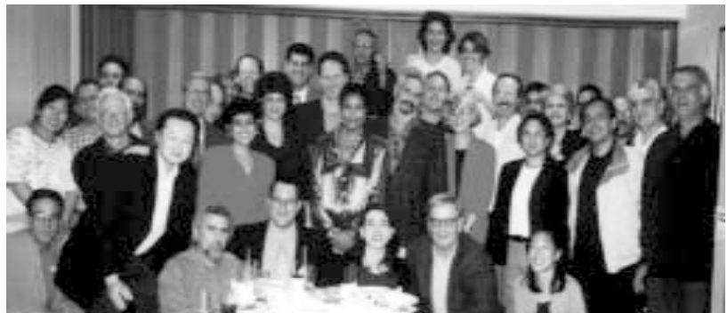
Alumni of the Cuban Visiting Researchers Program meet with visiting Harvard faculty members at a reception in Havana, Cuba

To raise the visibility of Cuban studies at Harvard, DRCLAS sponsored the Perspectives on Contemporary Cuba Lecture and Film Series, promoting discussions between academics and