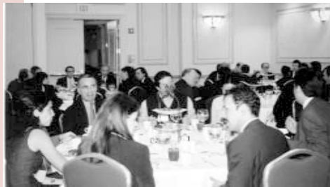
Corporate Partners Spring 2001 symposium in Miami