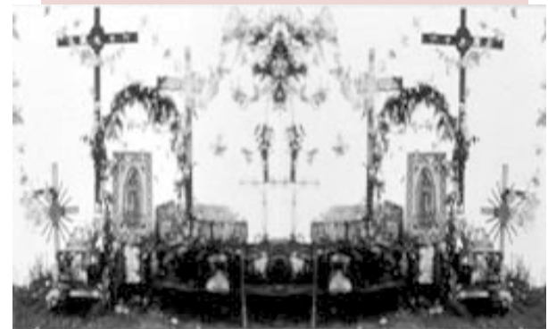
Cerro de la adoracion by Dominique Pepin