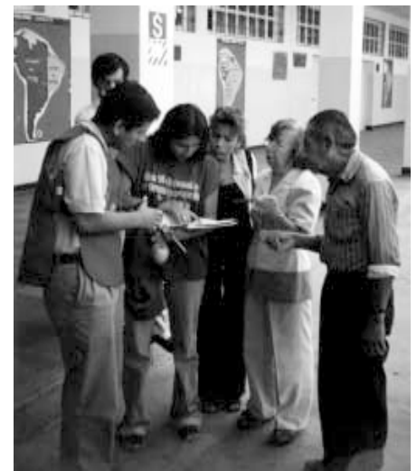
Harvard students sport official election monitoring vests while they work in Peru.

Since its founding, the Center has devoted a major portion of its attention and resources to addressing economic policy issues and their implications for growth and welfare in the region. The slowdown in the world economy exposed persistent vulnerability in a number of economies and made the development of effective policies even more urgent. At the same time, sluggish or declining growth rates made it even more difficult for governments to