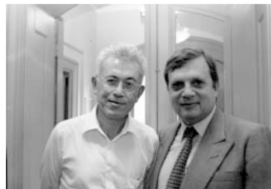
Harvard Law School Professor Roberto Mangabeira Unger and Governor Tasso Jereissati

16: DRCLAS Student Grant Reception for Summer 2001 Internship and Research Grant recipients