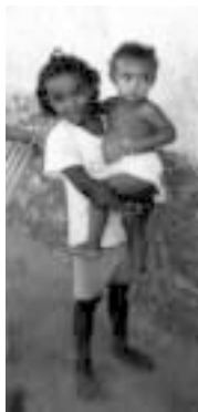
Children in Ceara, Brazil