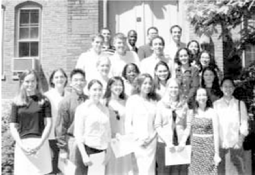
2001 recipients of the DRCLAS Certificate in Latin American Studies

This year, 22 graduating seniors were awarded certificates on June 6, 2001. After the presentation, the Center hosted a reception for students and their families along with the faculty and Center staff.