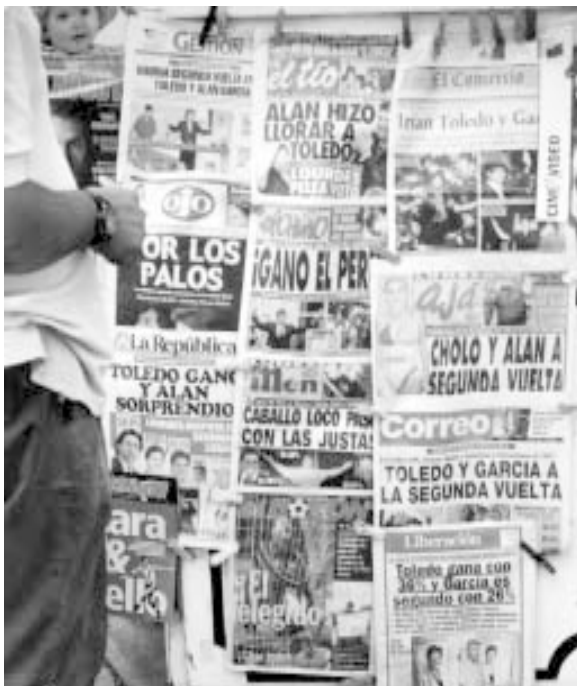
Photo of a newsstand in Perú, taken during the Freshman Seminar election monitoring trip

How Neighborhoods Matter: Community Participation and Social Isolation in a Puerto Rican Housing Project