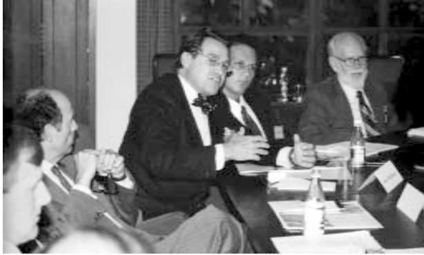
Fall 2000 seminar meeting

The Corporate Partners Program, now in its fifth year, provides corporations doing business in Latin America with access to Harvard's extensive resources on the region to promote dialogue on issues of mutual interest. This dynamic partnership between the Center and the corporate community offers business leaders an opportunity to interact with leading academics, policy makers, and other members of the private sector at Harvard University.